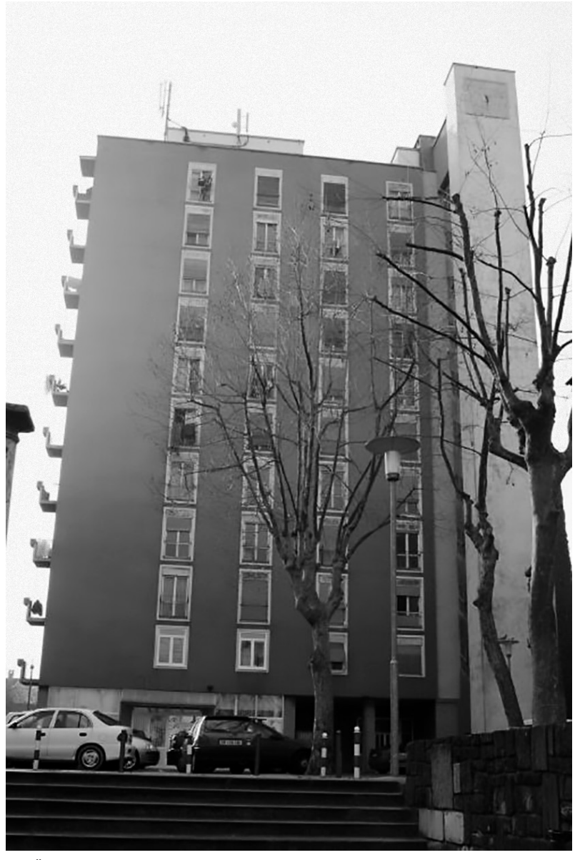
Fig. 7: Landmark – Tomos skyscraper, built in the historic core of Koper/Capodistria, architect Edo Mihevc, 1957–1960

process was a continuation of the Fascist approach, symbolised by the Sacrario di Redipuglia (Dato 2013; Klabjan 2017: 14). Yet, the post-war period built its symbolic landmarks as well, and hence the symbolic duel of landmarks is best discernible in two spatial dominants.