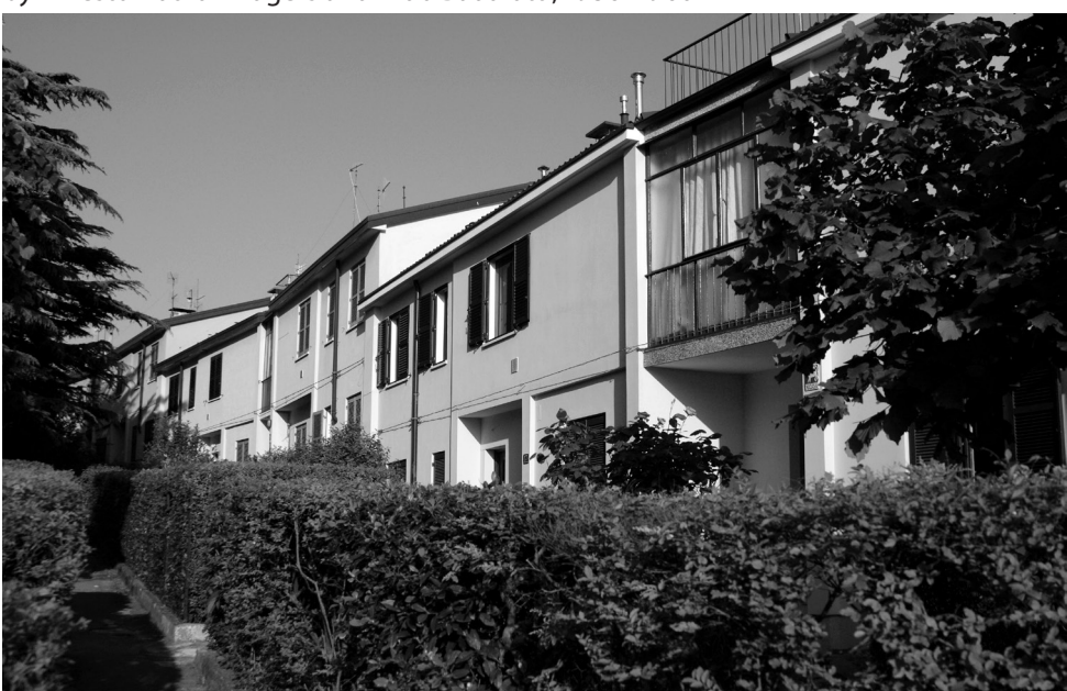
Fig. 6: View of the streets in the Borgo San Sergio, built according to the plan by Ernesto Nathan Rogers and Aldo Badalotti, 1956–1960