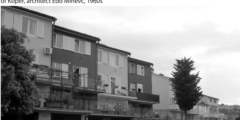
Fig. 5: View of the streets in the new neighbourhood of Semedela on the outskirts of Koper, architect Edo Mihevc, 1960s