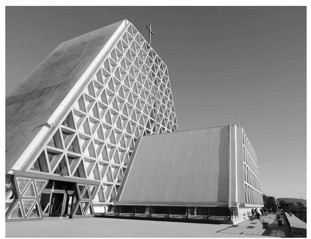
Fig. 8: Landmark – Sanctuary of St. Mary ( Svetišče na Vejni / Santuario mariano di Monte Grisa ) next to the Slovene village of Prosek/Prosecco, architect Agostino Guacci, built 1963–1967

As can be seen, sitting on the peak of the former island of the Venetian medieval town Koper/Capodistria, the red skyscraper of workers' flats has dominated the city-scape since 1960, "announcing the Slovene presence on the Adriatic" (Kresal 2016: 85). On the other side of the Gulf of Trieste, on the Karst boundary, next to the Slovene village of Prosek/Prosecco, the Sanctuary of St. Mary ( Svetišče na Vejni / Santuario mariano di Monte Grisa ) was built in 1963–1967.